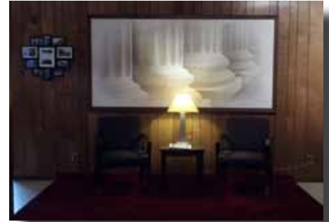
The Lodge History Display is taking shape!